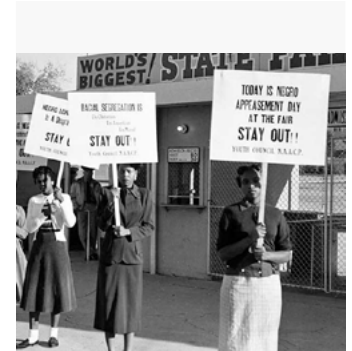
Photograph of NAACP Youth Council picket line at Texas State Fair by R.C. Hickman, October 1955. Image courtesy Hickman (R.C.) Photographic Archive, The Dolph Briscoe Center for American History, The University of Texas at Austin