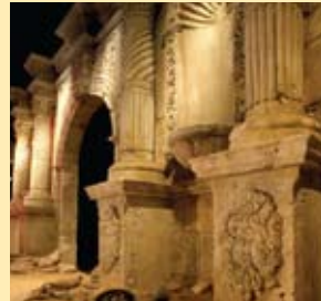
THE ROAD TO REVOLUTION Alamo Façade The entrance to the Revolution Theater represents the Alamo façade the day after the March 6, 1836 battle.