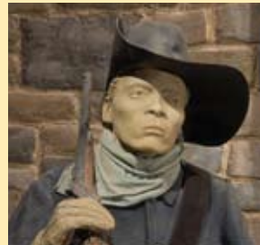
MOVING WEST Buffalo Soldier African-American soldiers served at many of the Forts located in Texas following the Civil War.