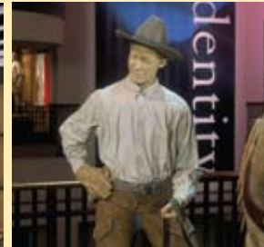
TEXAS CENTENNIAL CELEBRATION Western Identity A Fort Worth cowboy poses for a photograph as part of the effort to promote Texas' identity during the 1936 celebration.