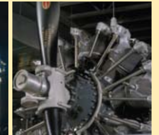
TEXAS AND THE NATION AT-6 "Texan" Made in Dallas, the AT-6 (ca. 1941-1942) served as a trainer aircraft for more than 100,000 World War II pilots.