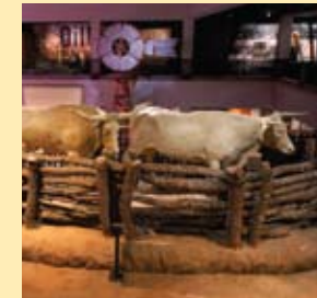
TEXAS RANCHING Longhorn Cattle The longhorn thrived in Texas where their strength allowed them to flourish on ranches throughout the state.