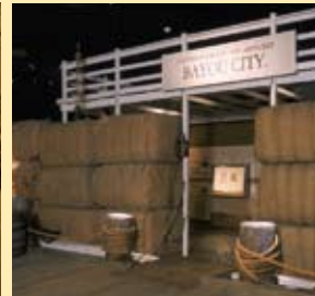
A NATION BECOMES A STATE Bayou City This façade represents a steamboat that shuttled travelers and goods between Houston and Galveston.