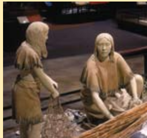
FIRST ENCOUNTERS Karankawa Canoe The Karankawa people inhabited the region along the Texas Gulf coast during the period of Spanish exploration.