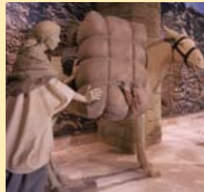
COLONIZATION Overland from Mexico to Tejas Mules were the most reliable transport over the rough terrain as early settlers to Texas traveled north from Mexico.