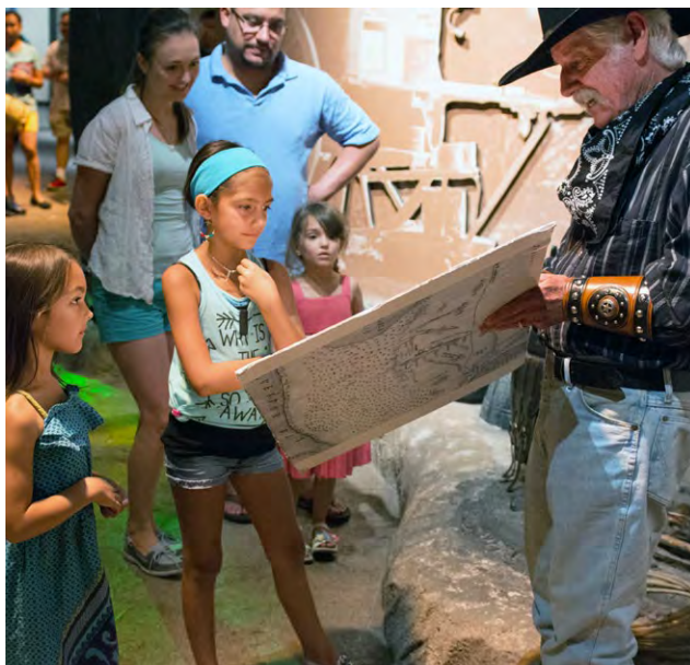
Volunteers stationed throughout the galleries illuminate Texas history. Right , a young artist creates at an art-making workshop.

With more than 18,000 hours of service during the previous year, 110 active volunteers greeted visitors, shared their knowledge with hands-on activities, and offered fascinating glimpses into