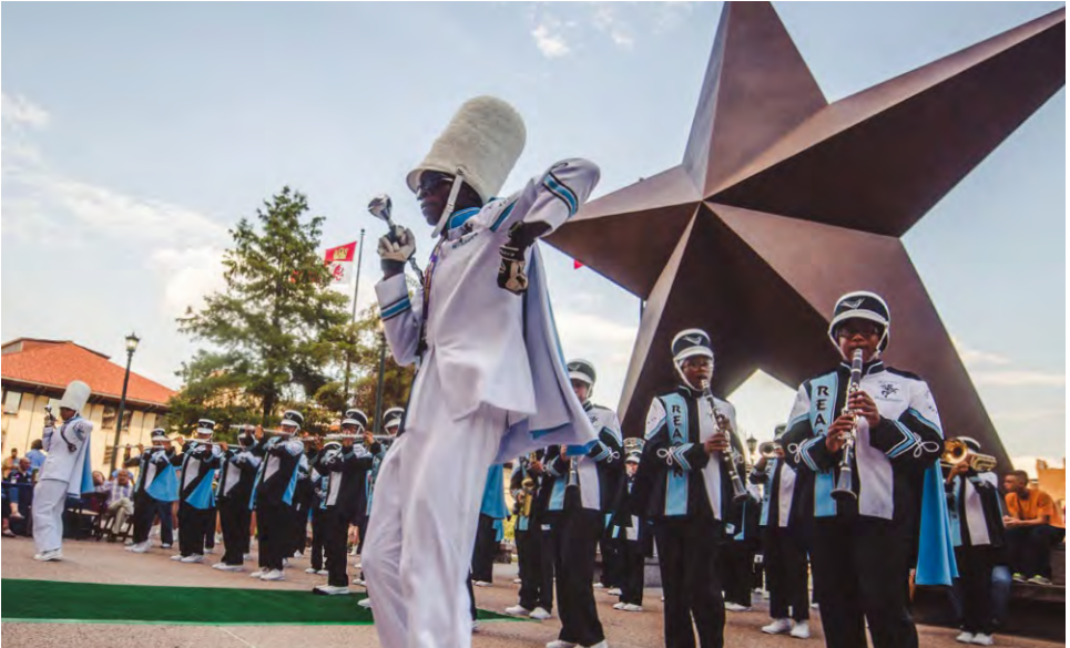
The John H. Reagan High School band ushers in the Gridiron Glory exhibition.