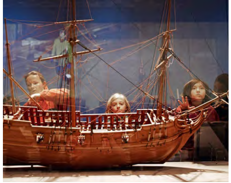
Young visitors explore the model ship, La Belle , part of the award-winning exhibition.