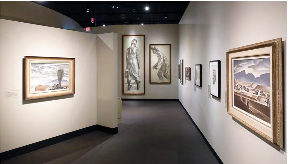
The exhibition on El Paso artist Tom Lea included works of art from over 20 collections.