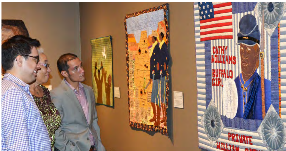
The Women of Color Quilters Network created over 50 quilts for the exhibition, And Still We Rise .