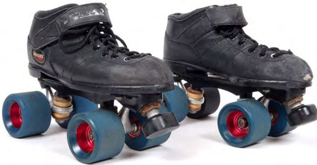
Skates belonging to Amy "Electra Blu" Sherman from the Roller Derby exhibition.

2015 featured the award-winning exhibition, La Belle: The Ship That Changed History , with the assembly of the hull's timbers in front of visitors in the Museum's Herzstein Gallery. Unique in design and interpretive approach with conservator and curator working in the gallery, the exhibition included touch tablet interactives with 360-degree artifact views and animations, and three audio/visual presentations, including a 22-foot wide wall projection featuring actual footage of the shipwreck's excavation in Matagorda Bay. The final event of the temporary exhibition was the delicate move of the 54-foot long ship, in full view of visitors, into its permanent location in the first floor gallery. In August,