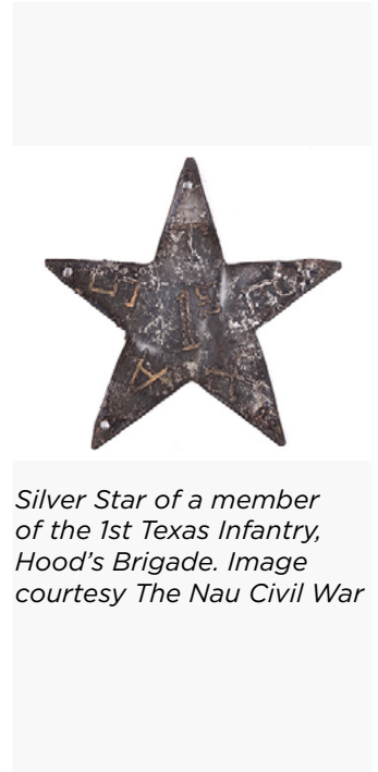
Silver Star of a member of the 1st Texas Infantry, Hood's Brigade.