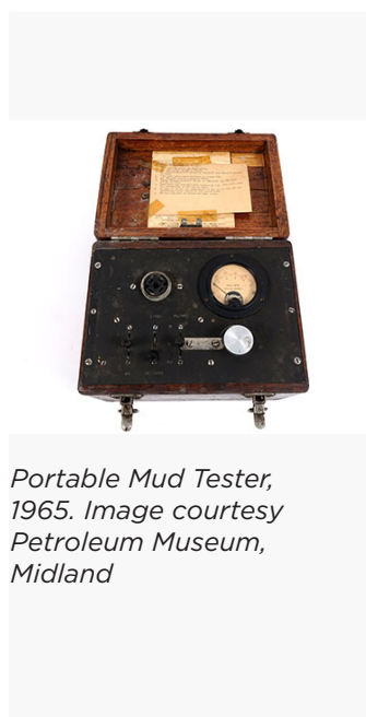
Portable Mud Tester, 1965.