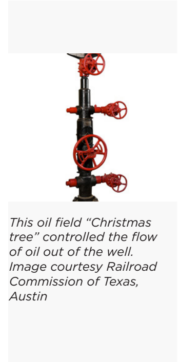
This oil field "Christmas tree" controlled the flow of oil out of the well.